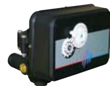
568 ROTARY CONTROL